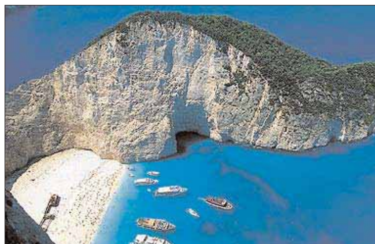
Perhaps the most famous of the island's beautiful beaches is the picture-postcard stretch of white sand along Shipwreck Cove

Gerakas beach, a perfect curve of golden sand, set right at the tip of the Vasilikos peninsula; those loggerhead turtles know how to pick a good spot.