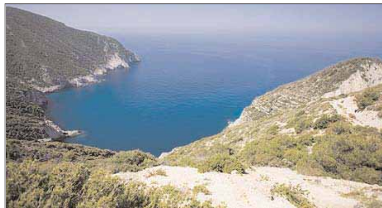
Away from the more developed south of the island, much of Zakynthos remains unspoilt