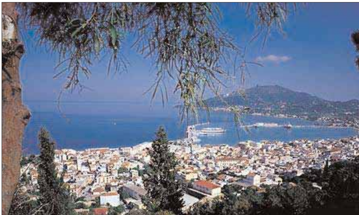
The blue skies and water off Zakynthos Town, which has temperatures in the mid-70s in September